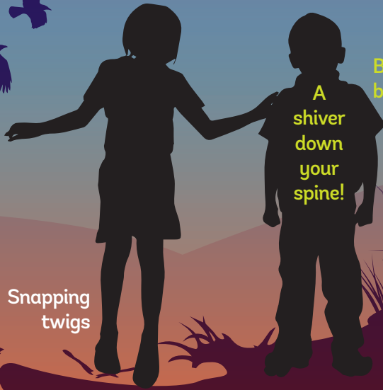
A shiver down your spine!