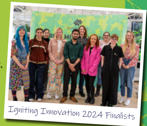
Igniting Innovation 2024 Finalists

It's all about empowering young people to fight climate change, boost biodiversity and support woods and wildlife.