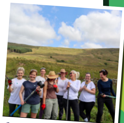
Snaizholme Beck 2024