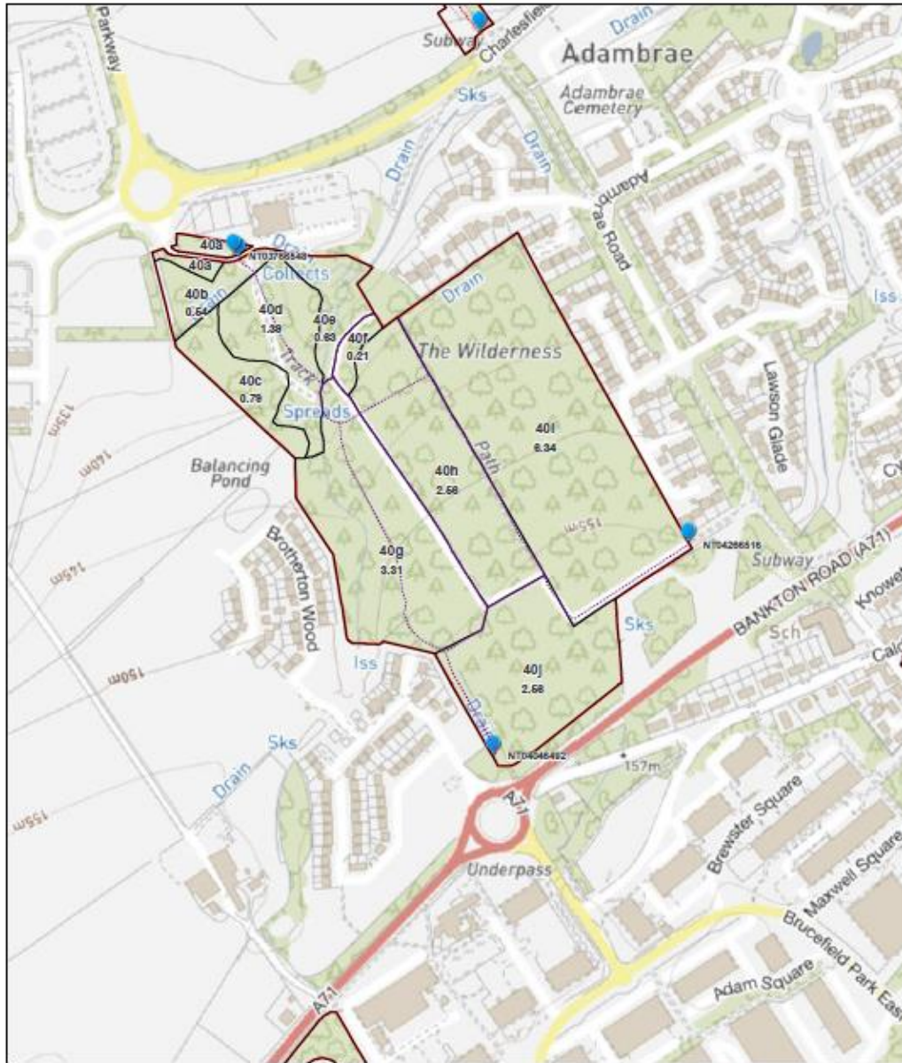
Wilderness compartment map