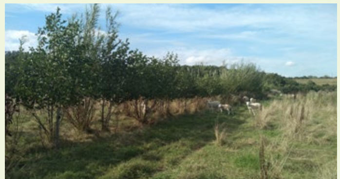
The Organic Research Centre conducting leaf sampling at Elm Farm and one of their grazed fields with recent tree planting.