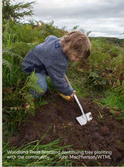
Woodland Trust Scotland continuing tree planting with the community.

many of the older trees in the woods and purchased the surrounding Skibo Estate, as well as building the now ruined cotton mill near the shore. Later, the estate was bought by the famous industrialist and philanthropist Andrew Carnegie. Woodland Trust Scotland became the custodians of this wood in 1993.