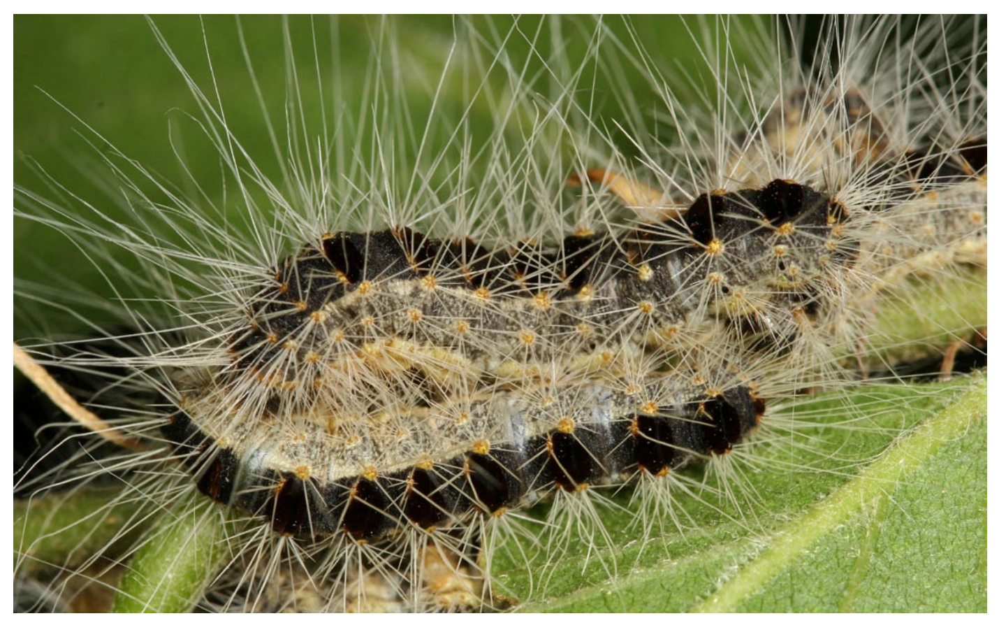
Oak processionary moth