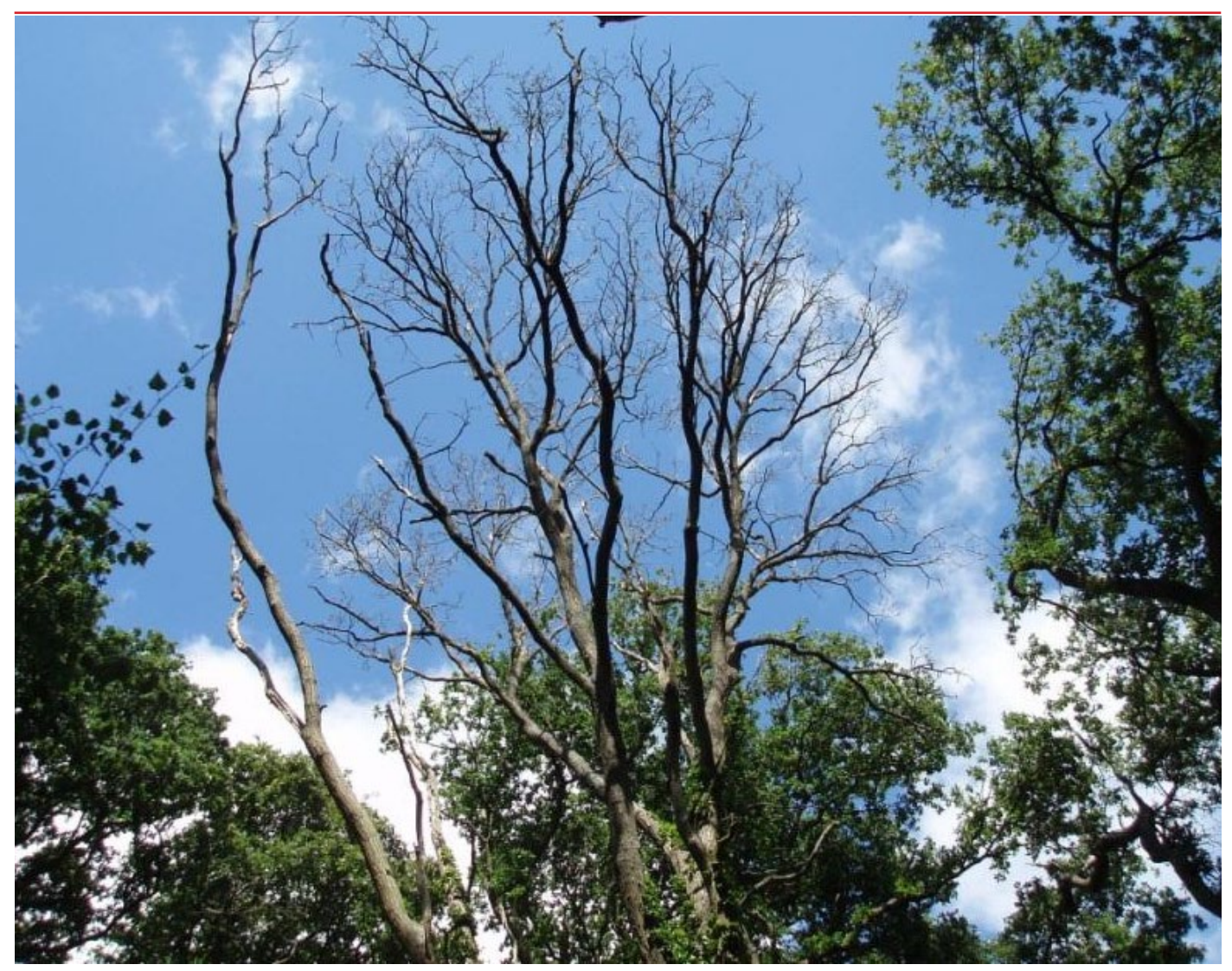
COD at Valley Park Woods

branch dieback. First the foliage deteriorates; leaves may grow smaller and pale to a yellow hue. The finer twigs and branches then die off, creating a stag's head appearance such as ancient trees develop, and a dark liquid may also be exuded from the bark. Death of the larger branches can follow, and finally the whole tree. Some individuals are able to stabilise and make a partial recovery, growing epicormic shoots, although further attacks can occur.