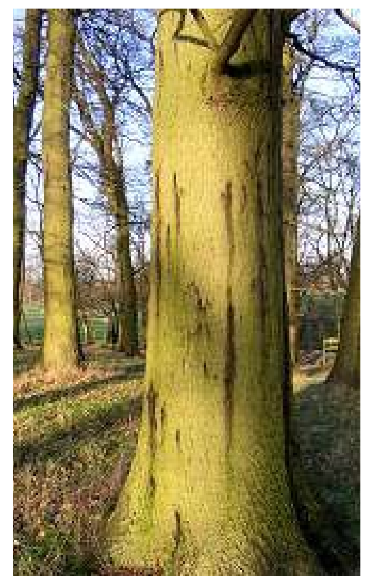
Acute oak decline stem bleeding

At the Woodland Trust's Valley Park Woods, Hampshire, signs of dieback in mature oak trees were first recorded in October 2010. Extensive