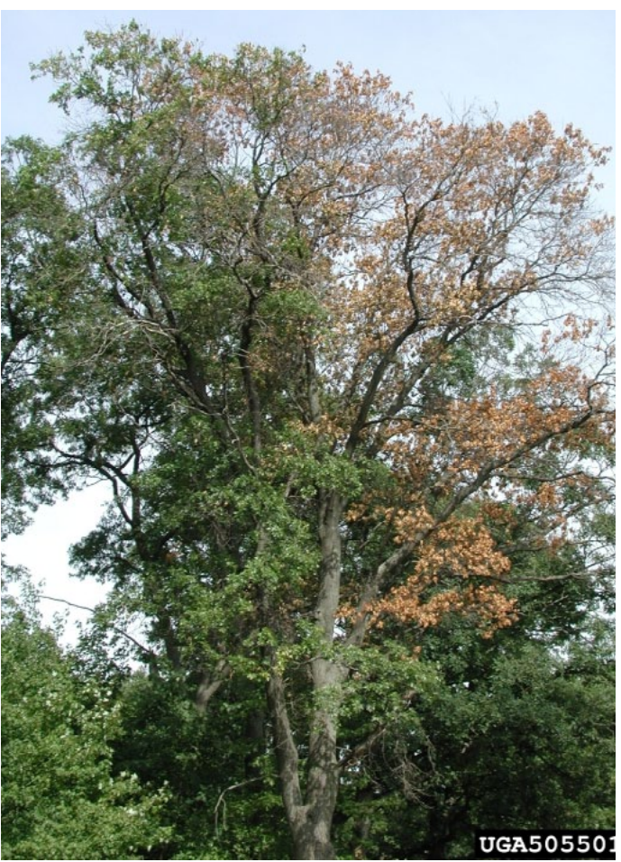
Oak wilt symptoms

If oaks are in close proximity to one another, the disease may spread from tree to tree through the interconnecting root systems. Generally, in woodlots and dense oak landscapes, one tier of trees is killed every year as the fungus moves out from the original infection center in a radial pattern. The disease may be confused with other oak diseases; numerous recent