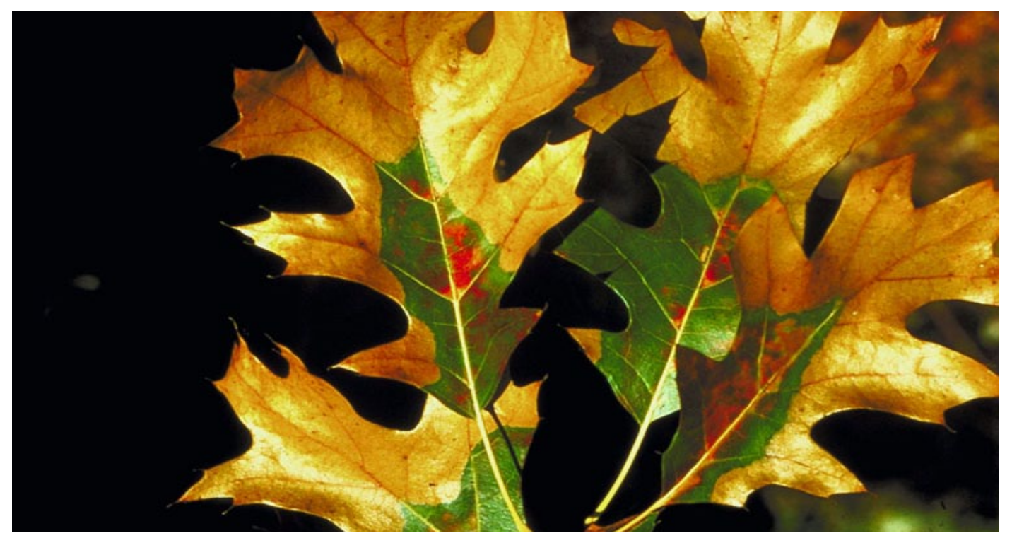
Oak wilt foliar symptoms on northern red oak

If this fungus reaches the UK it could cause serious damage to our already threatened oak trees. The UK's oaks are currently facing problems caused by acute oak decline and chronic oak decline. The Atlas of British Flora shows pendunculate oak to be widespread throughout the UK and sessile oak to be almost as extensive. They are also hugely important species for wildlife, timber and are emotionally significant for many people. The UK needs tough border controls and checks to keep oak wilt from becoming the next tree health issue.