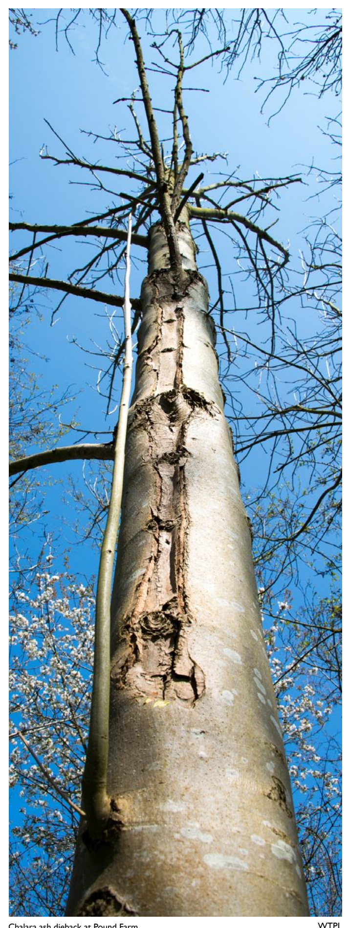
Chalara ash dieback at Pound Farm, canopy dieback and lesions