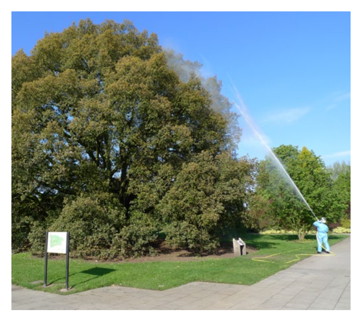
Spraying the Turners oak, Kew