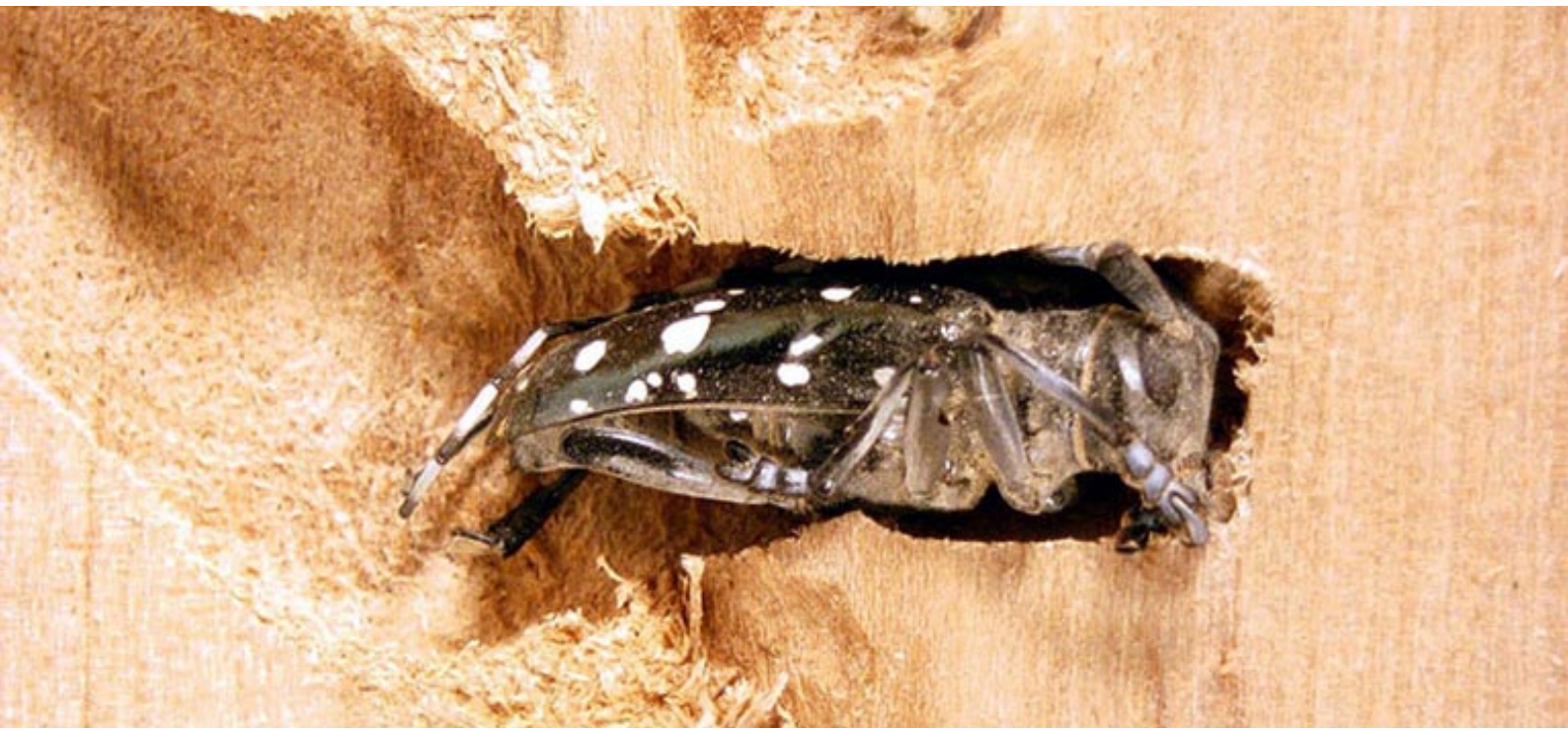
Adult ALB emerging from tree (post autoclave)

Threats to the health of UK trees are increasing and each decade seems to bring a new pest or disease that our woods, foresters and scientists must try to combat. Chalara ash dieback is the latest in a long line that includes the devastating Dutch elm disease, which resulted in the death of over 25 million of the UK's elm trees and still persists today.