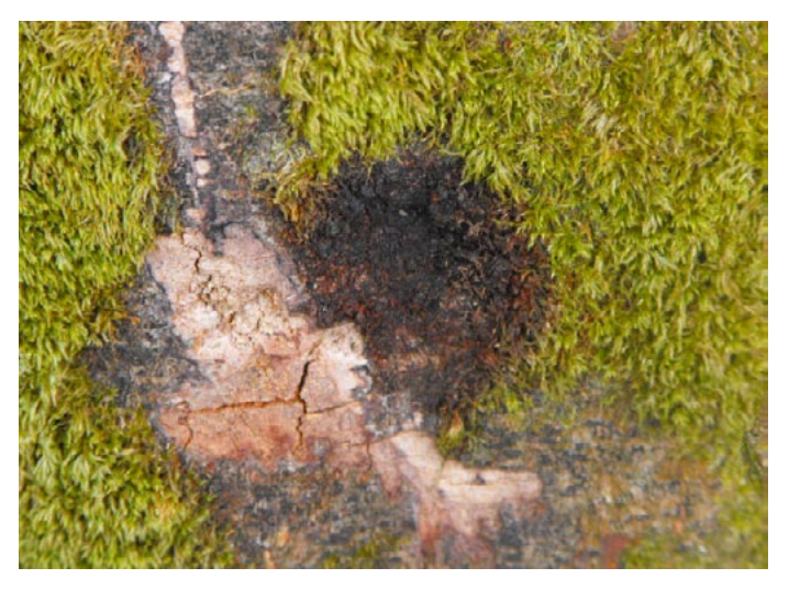
P ramorum lesion on beech

As the plantations were undergoing work to restore them back to native woodland they had already been thinned twice, and a healthy amount of natural broadleaf regeneration was coming through. The decision was taken to fell the larch to waste, leaving it on the ground and not removing from the site. This protected the native regeneration from damaging harvesting works. At this time sawmills also did not