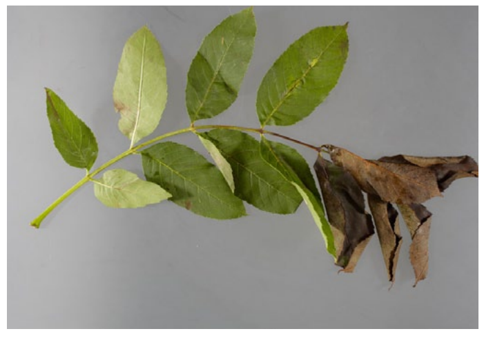
Chalara ash dieback leaf dieback