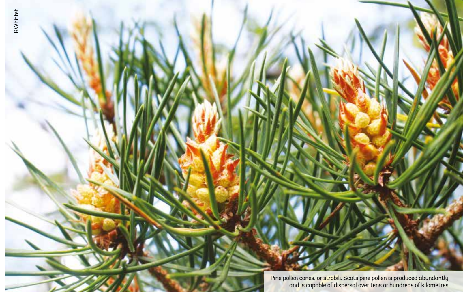
Pine pollen cones, or strobili. Scots pine pollen is produced abundantly and is capable of dispersal over tens or hundreds of kilometres

Trees produce large quantities of seedlings each year and each individual is unique in terms of the genetic variation it contains. Environmental conditions at the time will determine which of the individuals are the fittest, i.e. have a greater chance of survival and ability to reproduce. Fitter individuals make a greater contribution to subsequent generations, thereby enabling adaptive evolution by natural selection, producing a range of phenotypes best able to cope with local conditions. Selective pressures differ between sites, causing populations to become adaptively differentiated from one another.