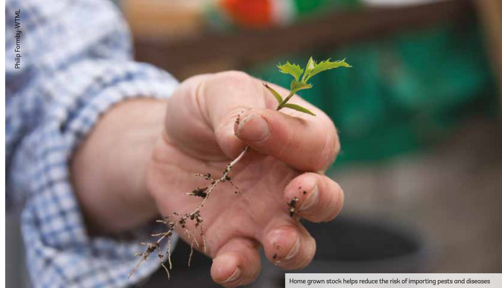
Home grown stock helps reduce the risk of importing pests and diseases

Information supplied by the project partners and other organisations (e.g. Wildlife Trusts, National Trust, and Natural England) was reviewed to identify candidate population sites for the target species, and a strategy recommended for all 16 species considering seed demand, seed viability, genetic diversity, appropriate seed production unit type and prioritisation. Research has shown there is enough information for most of the species to identify likely populations, seed stands and individual trees to improve seed supply. The Woodland Trust is working with the Future Trees Trust and others to develop a more detailed seed sourcing strategy for the species of most interest: aspen, black walnut, common alder, field maple, hornbeam, small-leaved lime, wild service, wild apple (crab), and yew. We also hope to develop strategies for the shrub species blackthorn, hawthorn, hazel, and privet.