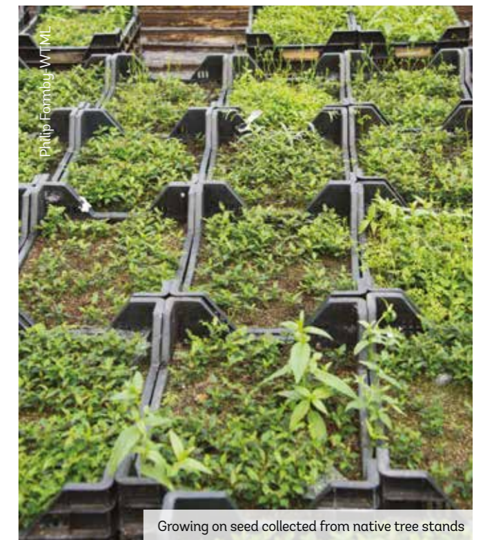
Growing on seed collected from native tree stands

For the more common broadleaved trees such as oak, birch and beech, there are already reliable registered seed stands within the UK, from which planting stock can be grown. However none of the less commonly planted broadleaved trees have registered seed stands in the UK, leading to a need for imports. We know from experience importing plants can introduce new tree pests or pathogens, and also risks importing stock that is not well adapted to UK conditions.