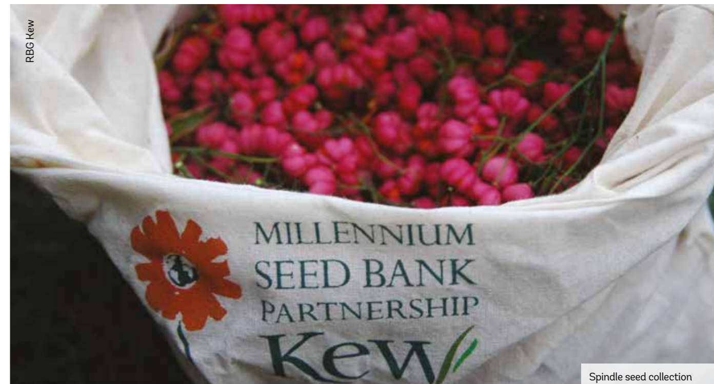
Spindle seed collection

The seed research component of the project seeks to better understand germination and seed storage requirements of the UK's trees and shrubs.