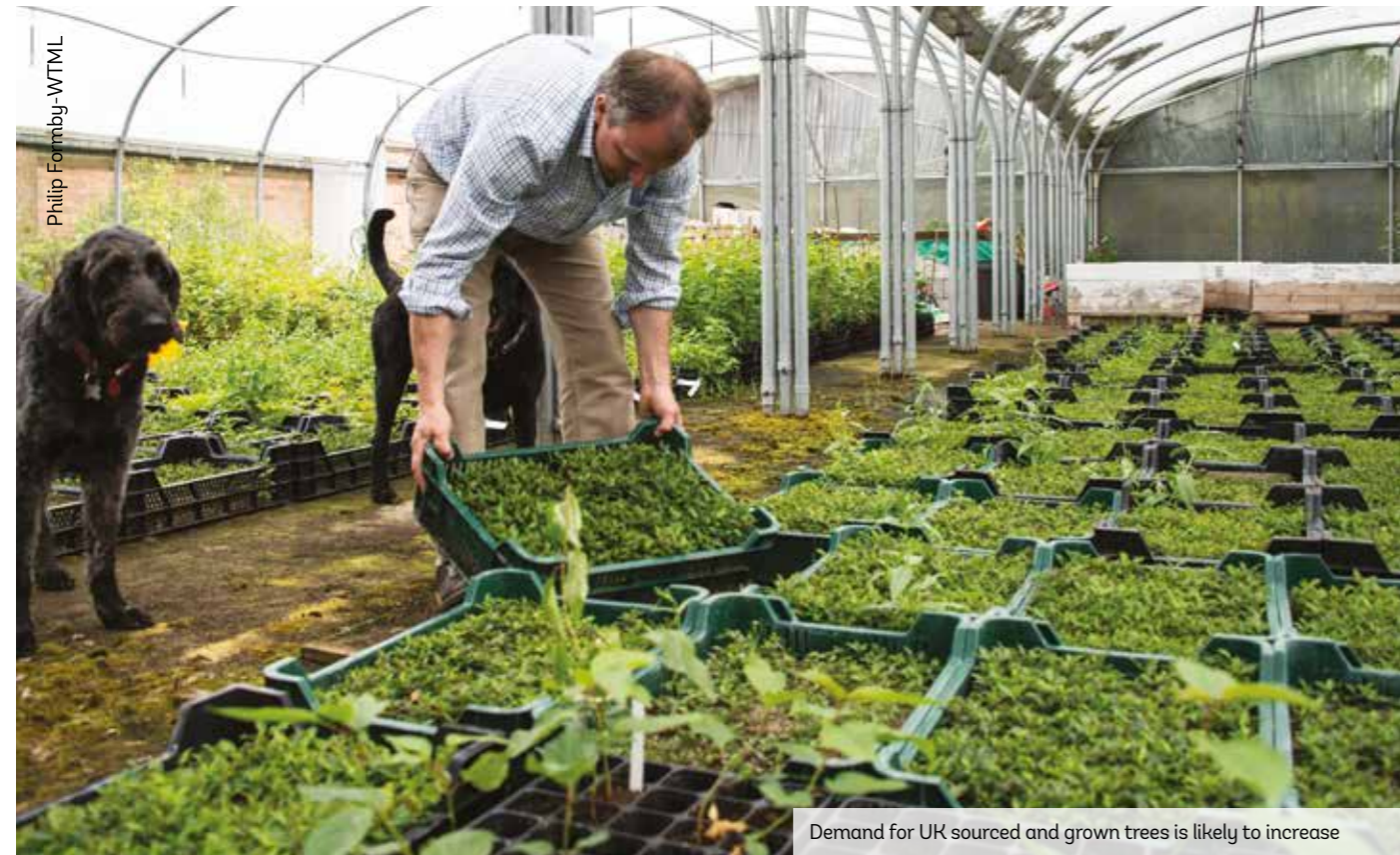
Demand for UK sourced and grown trees is likely to increase