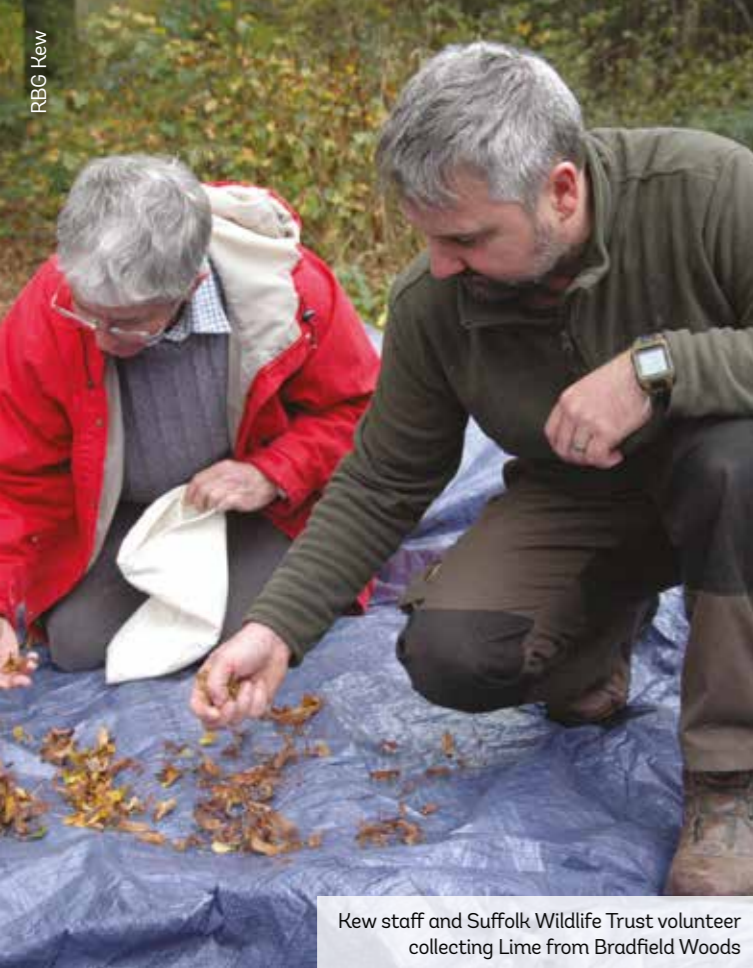
Kew staff and Suffolk Wildlife Trust volunteer collecting Lime from Bradfield Woods

understand the interactions of trees with pests and diseases and the development of potential management solutions. For example, the collections may be used to assess the efficacy of new treatments or preventative measures, and the impact of these on related and associated species.