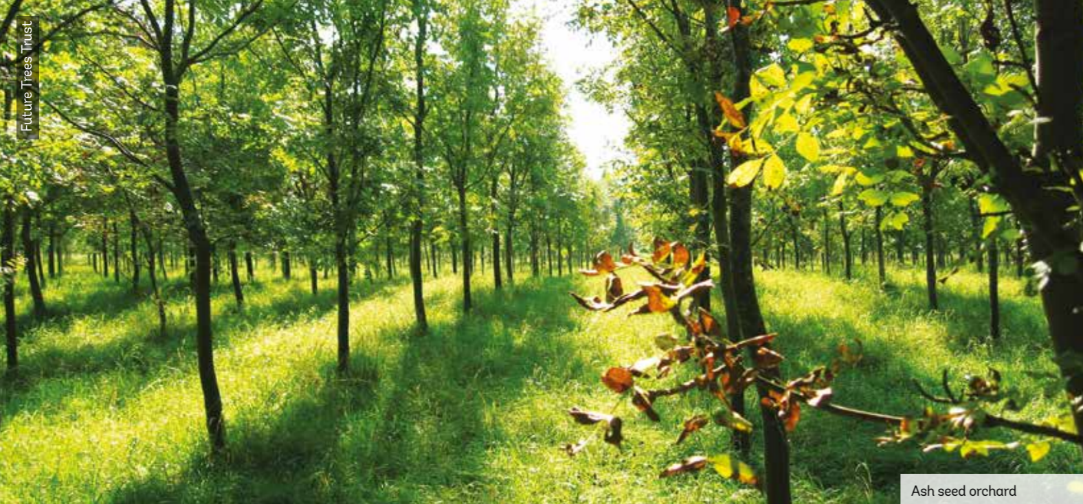
Ash seed orchard

However, a species' gene pool and associated genetic structure is not a fixed entity that can be preserved. Rather it reflects a continually fluctuating process through chance events (called genetic drift) and as a response to changes in the environment that consequently determine adaptation and survival.