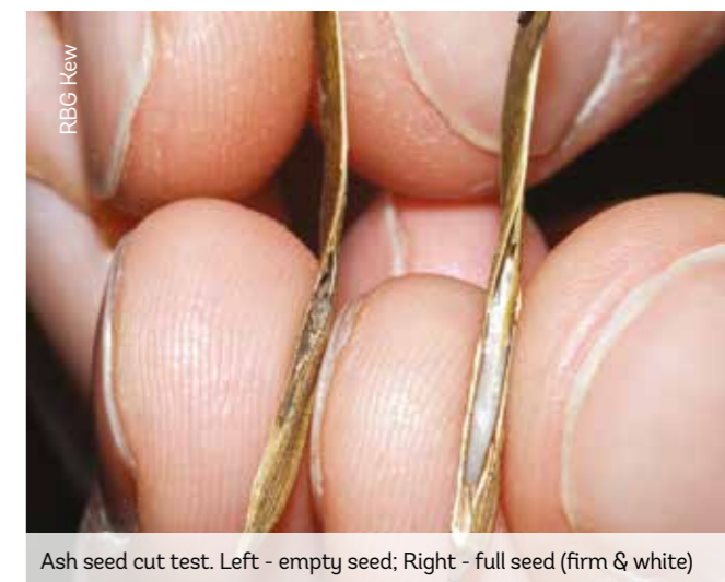
Ash seed cut test. Left - empty seed; Right - full seed (firm & white)

Working with geneticists, the sampling strategy is improving as the project evolves. A desk-based decision tree approach, first developed at Royal Botanic Gardens, Edinburgh, has helped identify what is already known