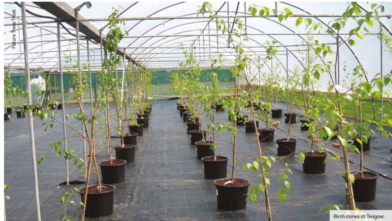
Birch clones at Teagasc