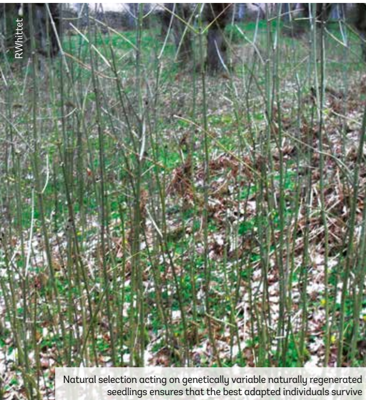
Natural selection acting on genetically variable naturally regenerated seedlings ensures that the best adapted individuals survive

Secondly, despite the differentiation between populations, there is typically very high variation within single