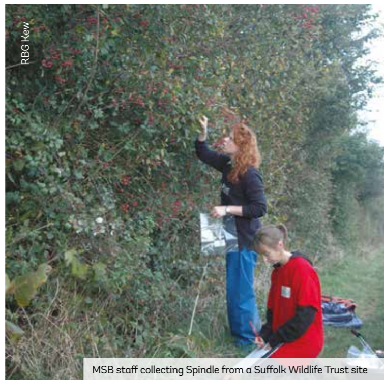
MSB staff collecting Spindle from a Suffolk Wildlife Trust site

Through the various partnerships, the UKNTSP is enhancing skills and knowledge in tree seed collecting and storage across a range of organisations, as well as raising awareness of issues such as genetic diversity and seed quality. Seed banking can play a significant role in understanding, conserving and wisely using the UK's forest genetic resources. As the project matures, Kew is engaging with others to consider how this tool could fit with others to develop a wider process for tree gene conservation, which should ensure a resilient woodland resource is available for many years to come.