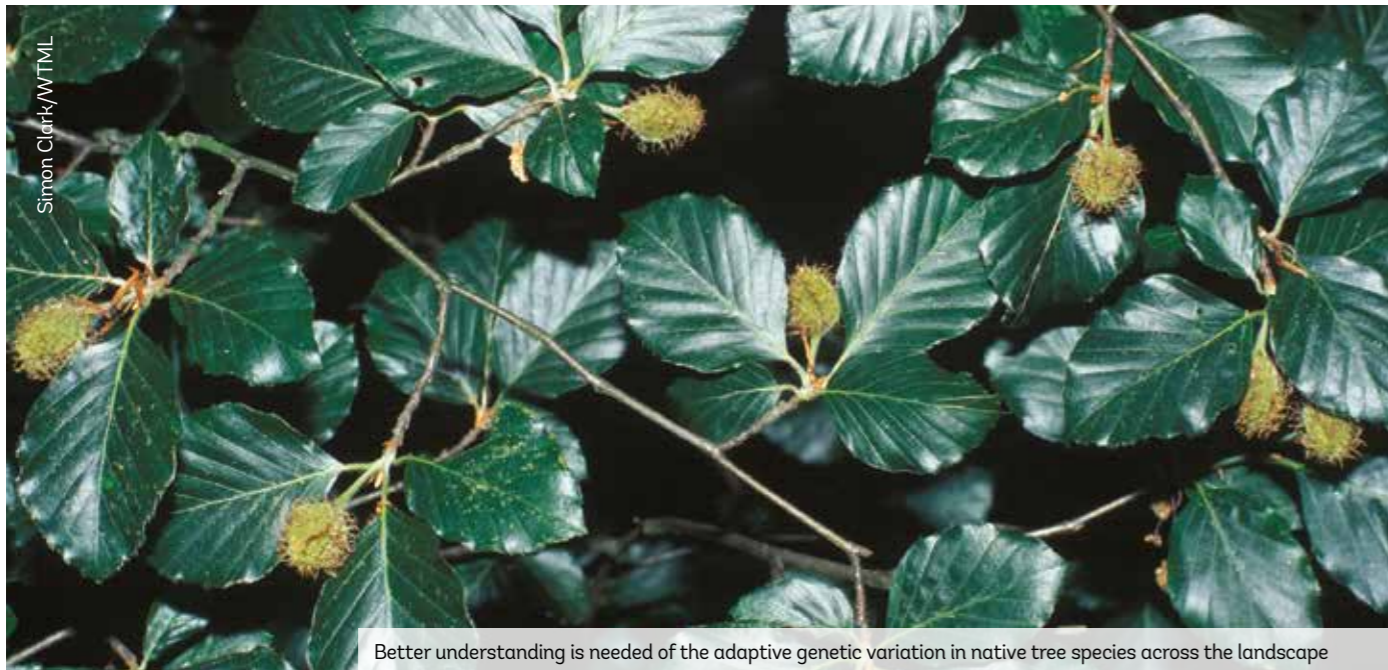
Better understanding is needed of the adaptive genetic variation in native tree species across the landscape