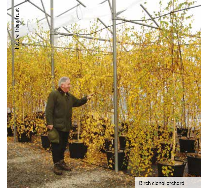
Birch clonal orchard

If you have an enthusiasm for the FTT's work or a specialist interest in any of the species we are currently improving (ash, birch, cherry, oak, sycamore, sweet chestnut and walnut), please get in touch. Membership is free and members are drawn from across the forestry and ecology sectors, including forest managers, researchers,