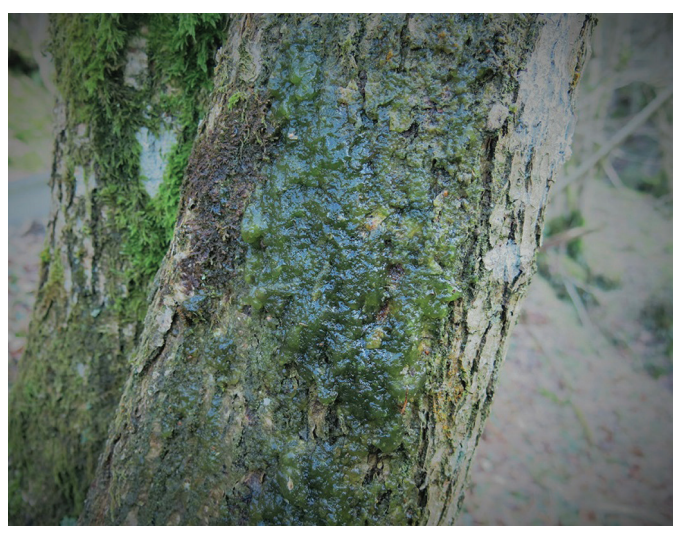
Trees covered with slimy algal 'gloop' due to ammonia pollution at Woodland Trust's Coed Gwernafon in Powys, Mid-Wales