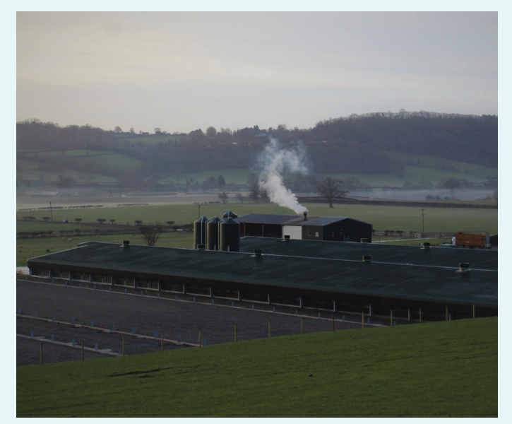
Ammonia emitting developments such as intensive poultry and livestock units can impact on nearby ancient woodlands

Ancient woodlands are being detrimentally impacted as a result of increasing concentrations of ammonia in the air and levels of nitrogen deposition. This is one of the greatest threats to ancient woodlands in the UK. New developments should not lead to further degradation of ancient woodland sites resulting from significant increases in atmospheric ammonia concentrations and total nitrogen deposition. In recent years, the Woodland Trust has seen an increase in planning applications for ammonia-emitting developments, such as intensive livestock units, in close proximity to ancient woodland sites. Evidence continues to strengthen concerns about nitrogen air-pollution impacts on ancient woodland ecosystems. This technical advice note provides a clear decisionmaking process for assessing the significance of new developments, where there is potential for ammonia air-pollution impacts on nearby ancient woodland sites.