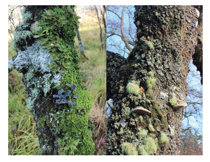
Healthy communities of lungwort lichens (left) and beard/horsehair lichens (right) on trees in Lochaber, Scotland, where ammonia pollution is very low