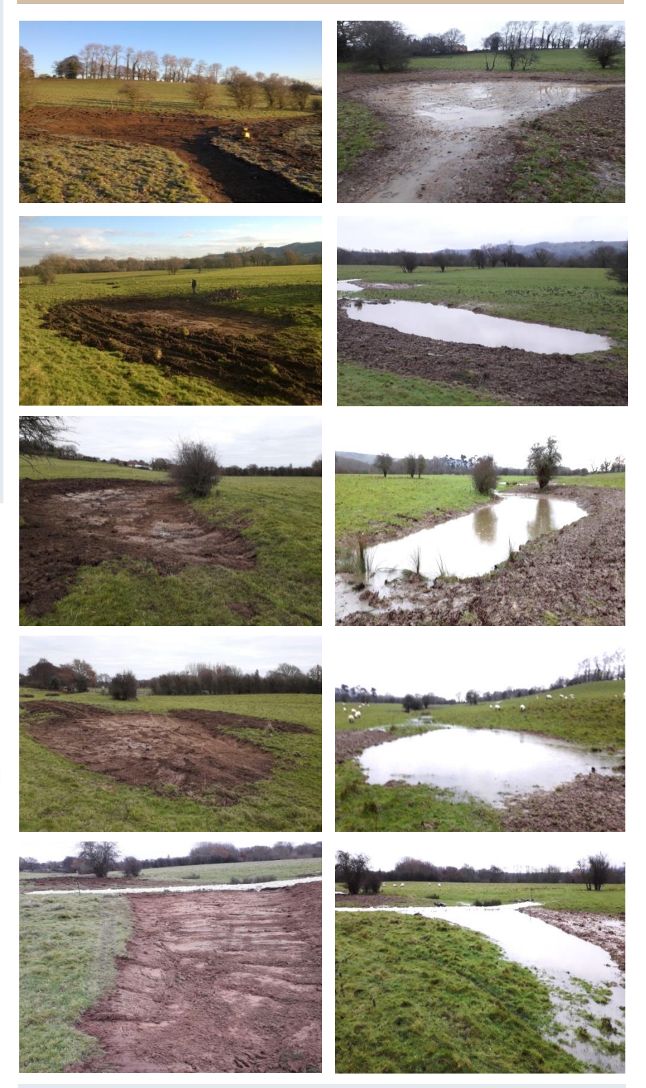
Figure 2. Scrapes before (left) and after (right) rainfall

The project was not on a main river or an ordinary watercourse, so it was not necessary to obtain Flood Risk Consent from either the Environment Agency or the Local Authority.