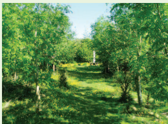
Kea Wood, Cornwall

Despite woodland covering 9% of the South West, many people still live a long way from an accessible woodland. Plus, there are areas where trees and woods can bring significant benefits, such as