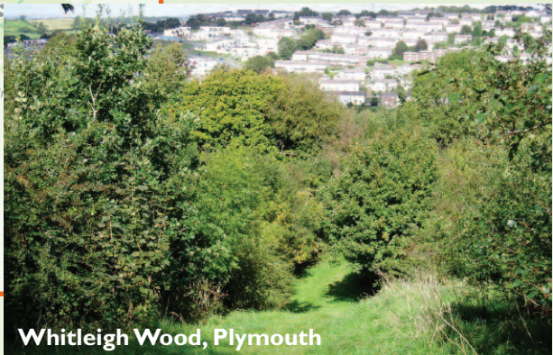
Whiteleigh Wood, Plymouth

Other landscape-scale partnerships: Kingsettle Wood and Mackintosh Davidson Wood in the Cranborne Chase Ancient Woodland Priority Area; working with partners in the Dartmoor, Exmoor and Cotswolds Ancient Woodland Priority Areas