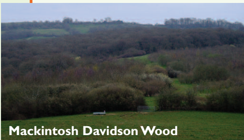
Mackintosh Davidson Wood

Planning obligation funding has enabled the Langage Landscape Fund to provide £250,000 towards a targeted woodland creation initiative delivered by the Trust's MOREwoods scheme. This exciting initiative will involve creating around 50ha of new woodland on other people's land in the GI project area.