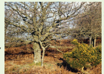
Shapter Woods, Devon

Ancient woodland is irreplaceable and home to more rare and threatened species than any other UK habitat, so we strive to protect it. We lobby for it to have explicit protection in planning documents; we encourage local authorities to update their ancient woodland inventories; and we fight threats from new developments.