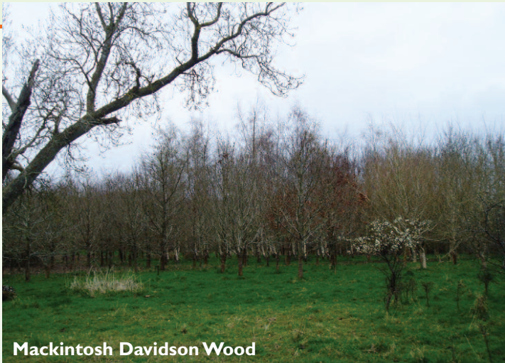
Mackintosh Davidson Wood

Mackintosh Davidson Wood, Wiltshire Mackintosh Davidson Wood is situated just to the south of the village of West Knoyle on the Wiltshire/Dorset border, and was acquired by the Trust in 1993 thanks to a generous benefactor. It provides an outstanding example of integrated woodland creation, with the new tree planting in 1995-96 linking and buffering the existing ancient semi-natural woodland and complimenting the site's permanent pasture, which is managed as unimproved grassland, rough grassland and scrub. This creative combination of trees and open space makes for a most attractive landscape with high biodiversity potential, and