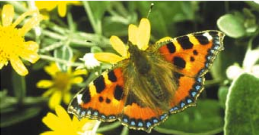
Small tortoiseshell

Please see the back page for contact details.