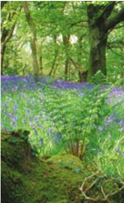
Green Castle Woods, Carmarthenshire WTP/LSteven Kind