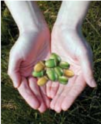
Acorns in hands

If you have decided to give a gift to the Trust – thank you. We are indebted to everyone for their thoughtfulness in considering the work of the Trust in this very special way.