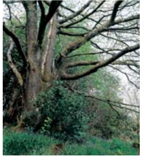
Drumlamph Woodland, Lderry

Drumlamph was the Trust's first ancient woodland acquisition in Northern Ireland. This 46-acre (19-hectare) wood is thought to be one of Northern Ireland's few remaining ancient woods.