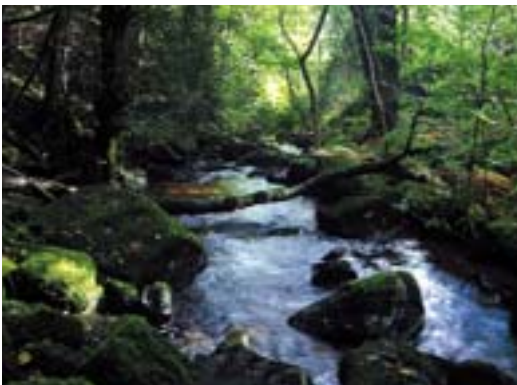
Houndtor Wood

For example, if a higher rate taxpayer gives land to charity worth £100,000, the charity issues a certificate describing the gift and the date it was given and the tax-paying donor will receive a £40,000 deduction in their income tax bill, (providing they had paid at least £40,000 Income Tax on their income in the relevant tax year).