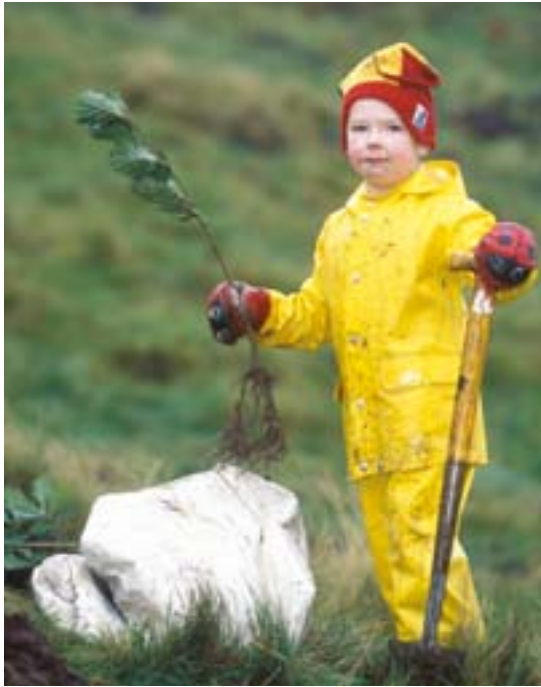
Glen Quey

Inheritance tax is the tax payable on your estate after your death.