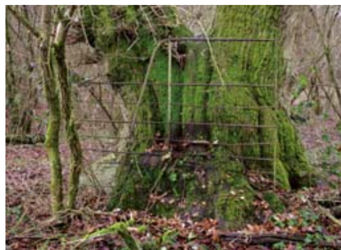
Remnant iron railing embedded in an ancient oak

The designers and managers of the original historic landscapes did not have to contend with the damaging effects of 20th-century farming, forestry and game management or development such as new leisure facilities or to cater for the use of cars. They did however often consider the impact of grazing animals. Many individual landscape trees and clumps were originally fenced, often with iron railings. Large numbers of these railings are said to have been removed as a source of scrap metal during the Second World War and at the same time many herb-rich parkland grasslands were cultivated for arable production.