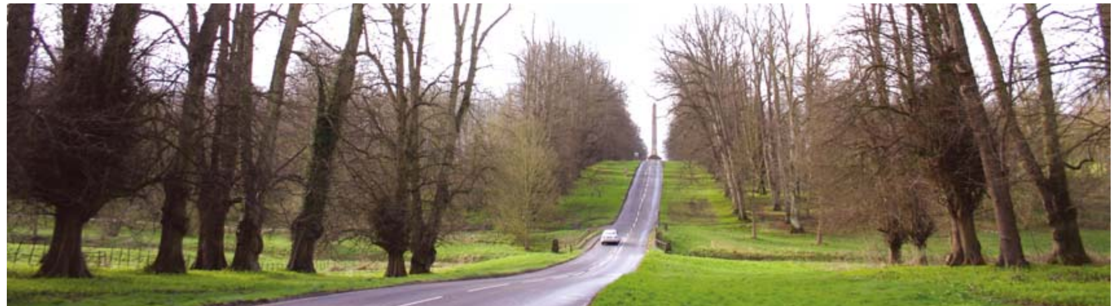
Ancient Tree Guides No.2: Trees in historic parks and landscape gardens