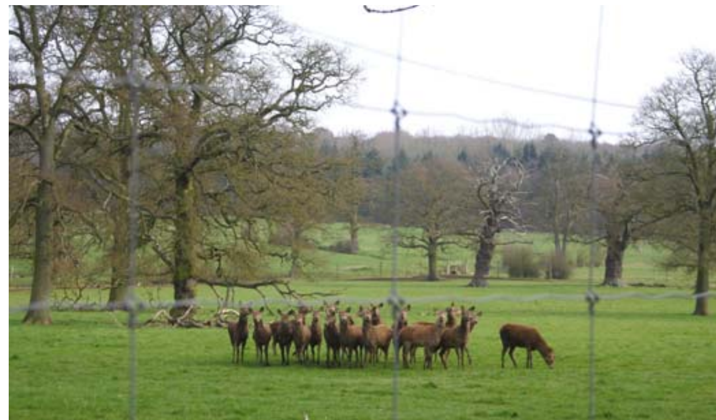
Whittlebury Park is divided by a main road. One side of the road is still an historic deer park designated an Site of Special Scientific Interest.

Grazing animals are an essential and very beneficial part of the sustainable management of parkland, however it is vital that the right mix of grazing and browsing animals are involved and are managed to enhance biodiversity and the landscape.