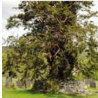
Churchyards, are a stronghold for ancient yews such as this one at Strata Florida in Wales, said to stand over the burial site of Dafydd ap Gwilym.