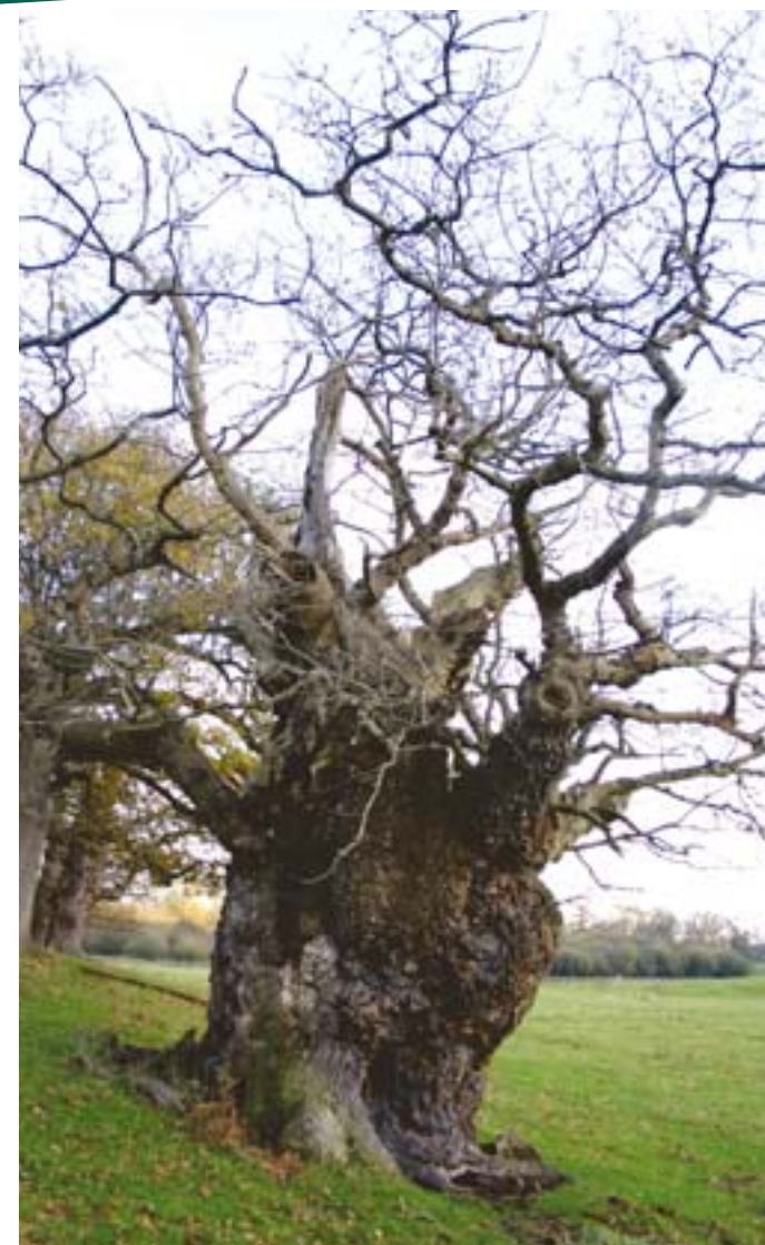
This Moccas Park oak was at one time thought the only tree in the country that was host to a particular species of beetle.