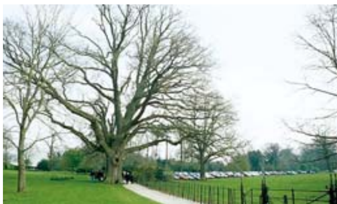
Before: Visitors, the 'target', are too close to this 500 year old oak.