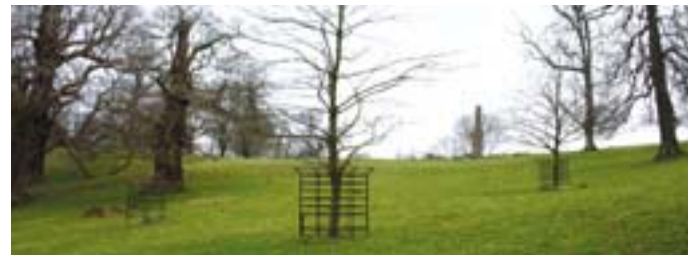
Young tree protected by traditional parkland railing.