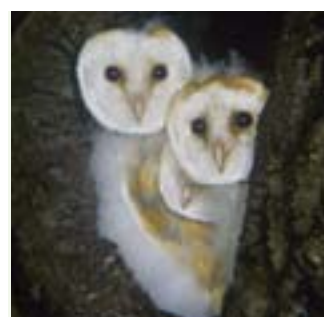
Owl in hollow tree.