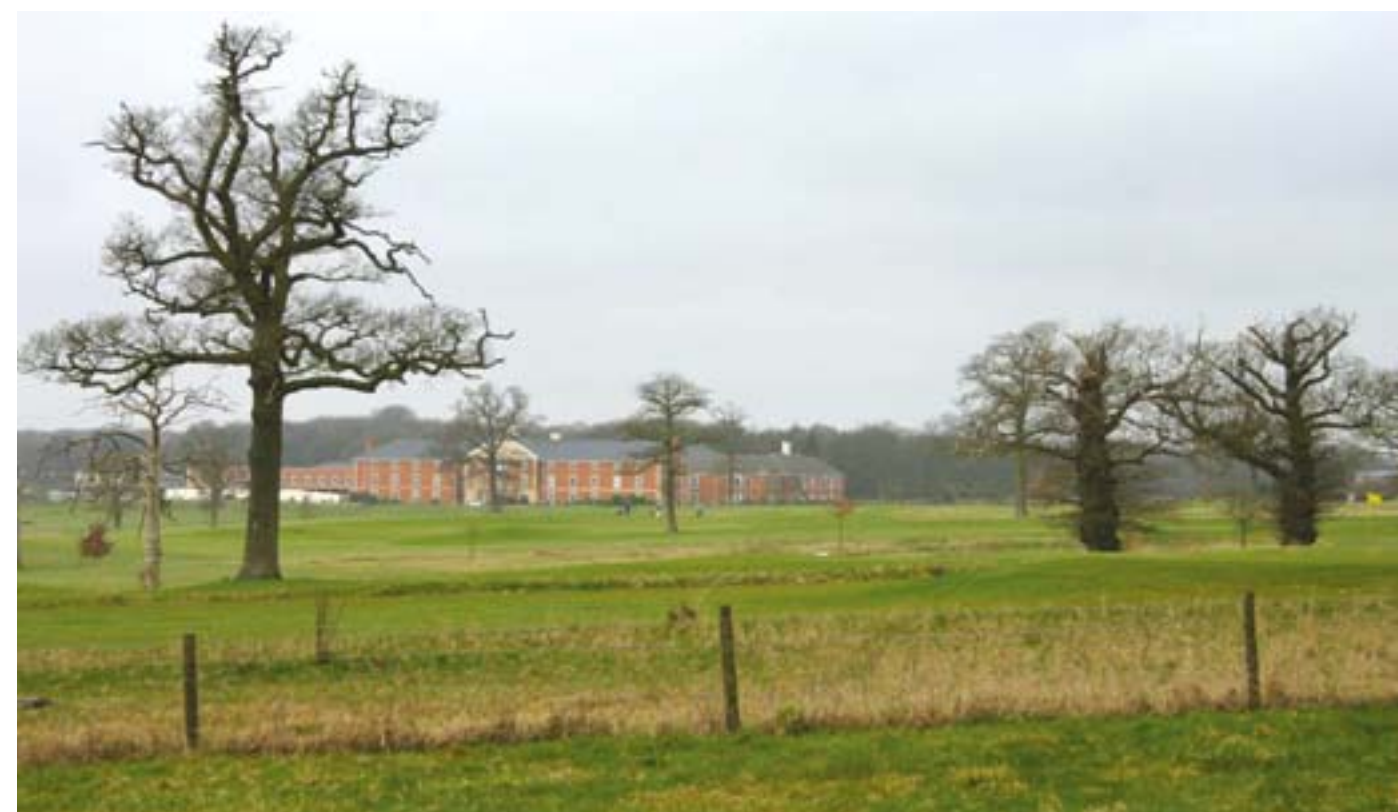
On the other side it has been converted to a golf course. As many of the old trees have been incorporated into the design, it is possible to maintain and enhance the continuity of the landscape by caring for the trees and planting for the future.