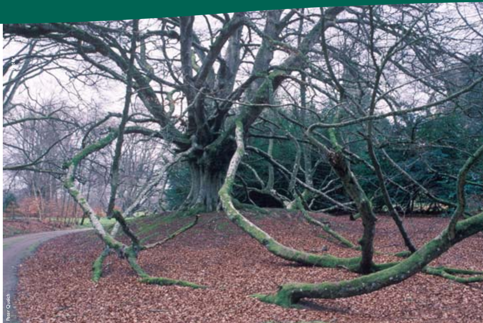
▲ Kilravock beech – a wonderful layering tree.

Crown retrenchment may prolong a tree's life ►