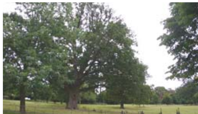
After: Visitors are no longer at risk, the path and car park have been relocated.