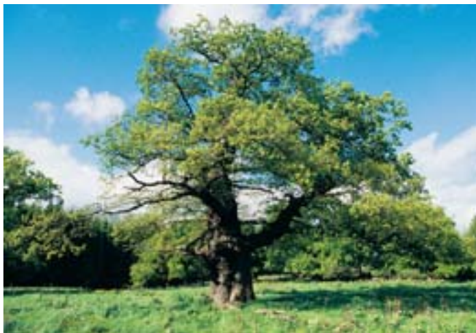
Ancient oak in the historic park at Cadzow, Hamilton.

The registers and other inventories of parks and gardens in the UK record designed landscapes of special historic interest and include many different types of sites. Registered designed landscapes are of national significance and as such are a material consideration for local planning authorities in determining planning applications. The oldest surviving parks and gardens are likely to be considered for inclusion on the registers, and later Georgian and Victorian parks if they are representative of an important design and relatively intact. Specimen trees, shrubberies, parkland clumps, shelter belts and woods may all be features of designed landscapes.