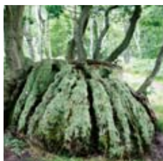
Stumps can provide valuable habitat