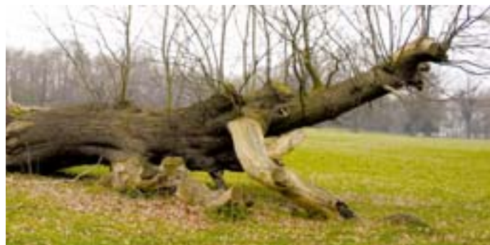
A fallen tree may regenerate if given the chance.

“ We should do everything we can to prolong the lives of ancient trees. They are witnesses to the past, survivors in historic landscape; each has its own significant story. ”