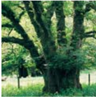
An ancient surviving sessile oak in Dalkeith Park, Midlothian, which was once a medieval hunting park.