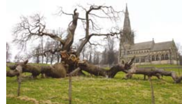
Leave limbs where they fall.

Ecosystems rely on the recycling of nutrients from fallen wood by micro-organisms. Such wood should be retained as close as possible to where it has fallen. It can then slowly decay back into the soil and the nutrients become readily available for the tree to reuse.